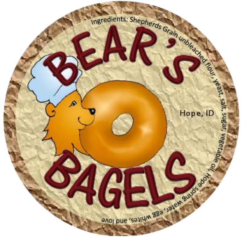
BEAR'S BAGEL LOGO AND LABEL, PNG AND JPG